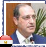
Moderator from Egypt Prof. Ashraf Sewelam Egypt