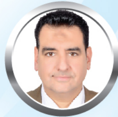
Ayman Elghonemy Memorial Institute for Ophthalmic Research (MIOR)