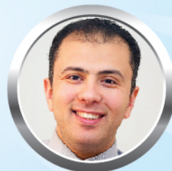
Sameh Galal Research Institute of Ophthalmology (RIO)