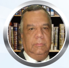
Gamal Sobhy Memorial Institute for Ophthalmic Research