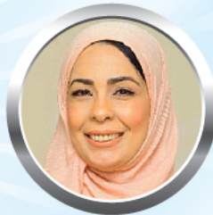
Heba Metwally Memorial Institute for Ophthalmic Research (MIOR)